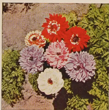
ST. BRIGID ANEMONE Bright double and semi-double flowers

RANUNCULUS (2nd size) Red Orange White Pink Any color: 12 bulbs 85c; 25 for $1.55; 100 for $5.25 Mixed colors: 12 bulbs 75c; 25 for $1.40; 100 for $4.95